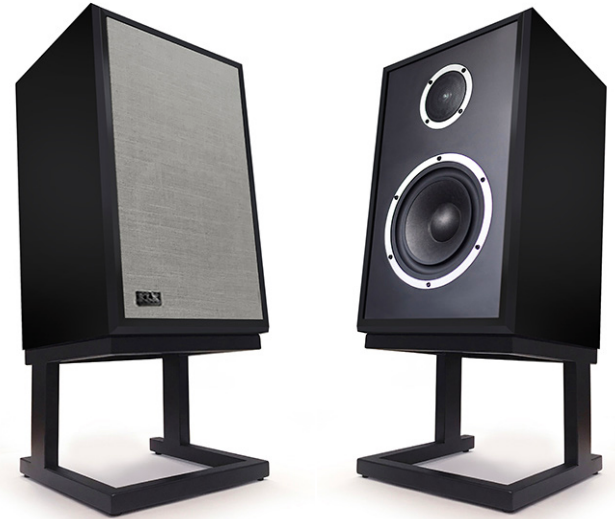
Shown in Nordic Noir SKU#: KLHF00080

Basalt Black Knit Grille available by special order