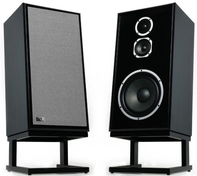
Shown in Nordic Noir SKU#: KLHF00078

Basalt Black Knit Grille available by special order